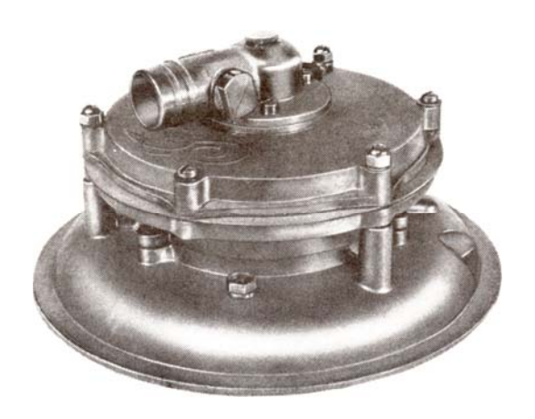
Model 300A Carburetor (without air cleaner)

YELLOW: Silicone diaphragm material is the optional upgrade material that provides excellent flexibility in cold weather climates and is more resistant to chemical contamination.